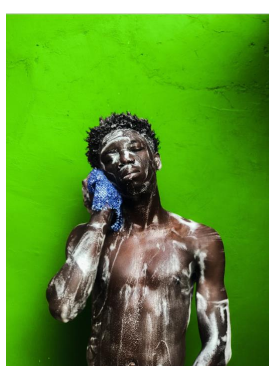
Self Portrait [Prayer purifies the soul, charity purifies wealth, and the bath purifies the body] 2021